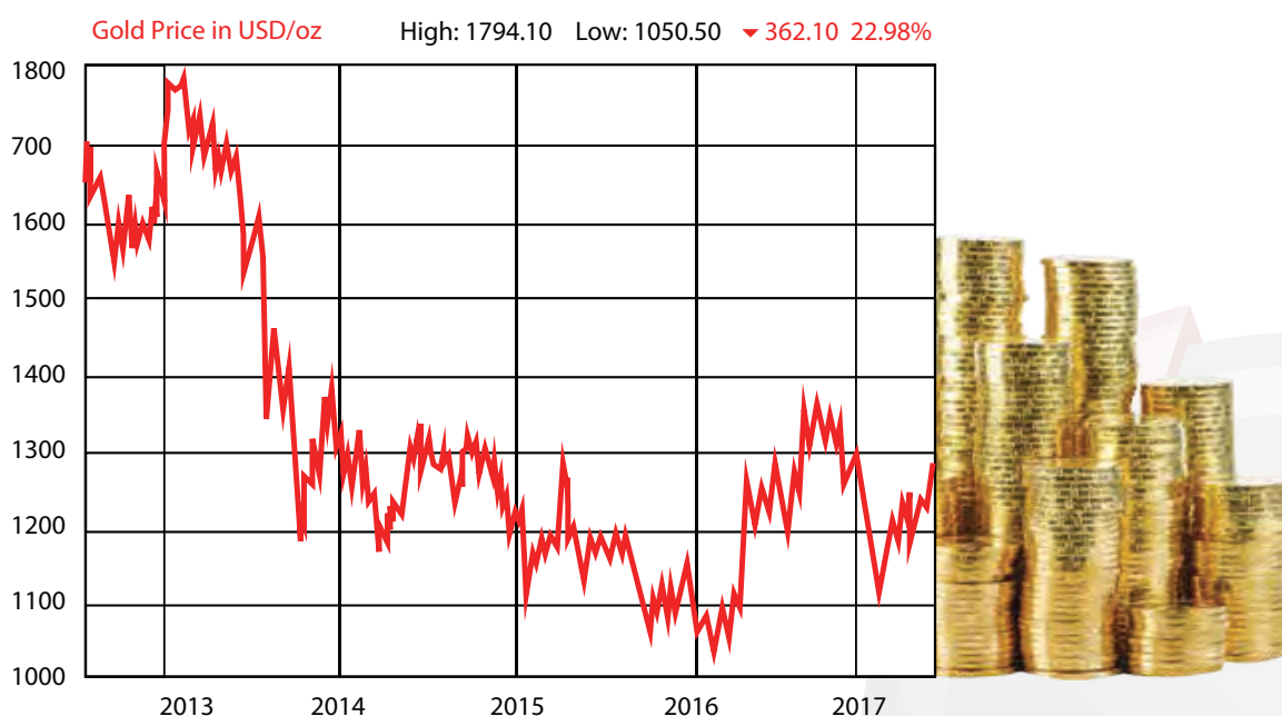
Figure 2: Gold Is No Longer a Safe Haven